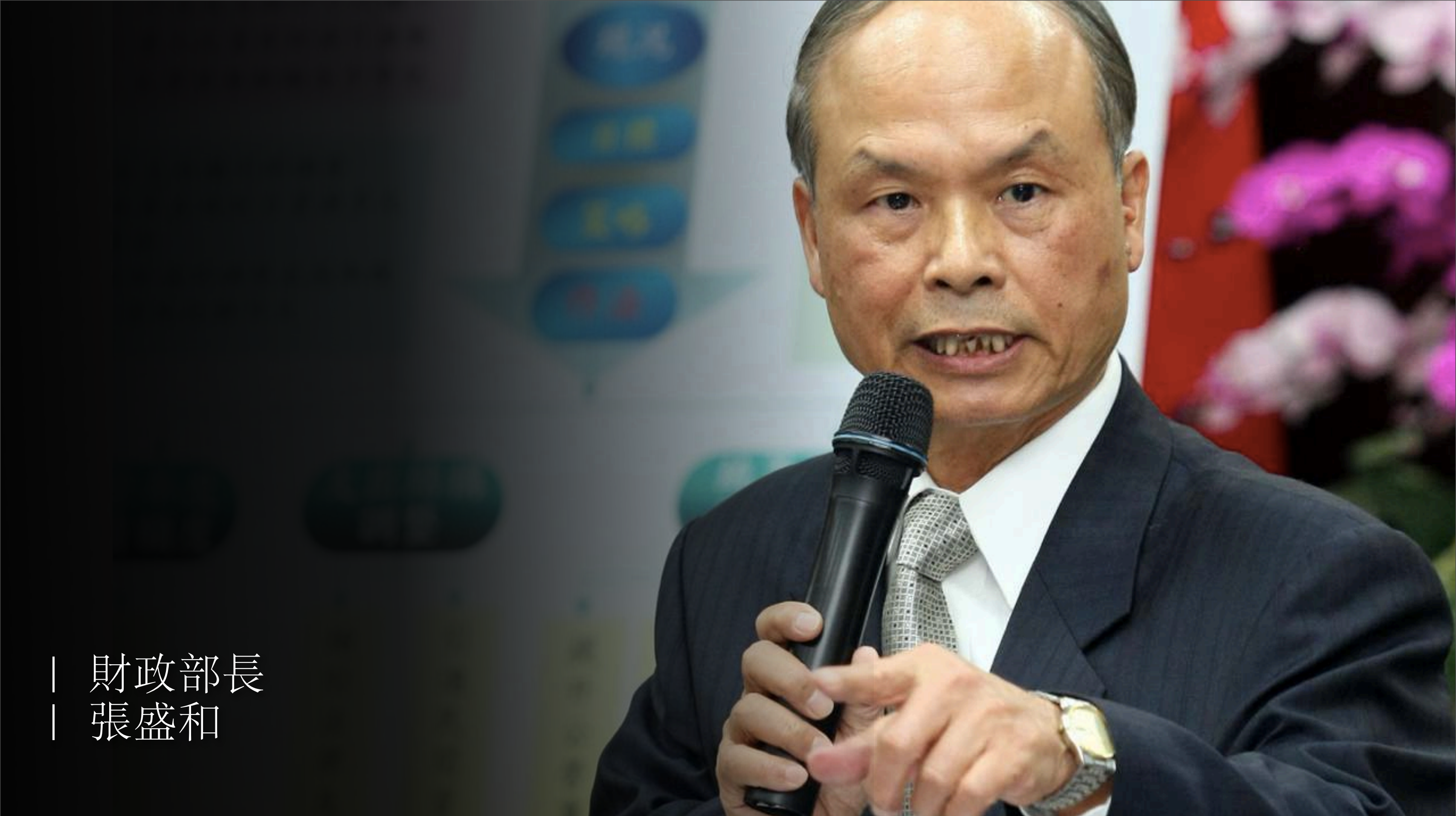
| 財政部長 | 張盛和